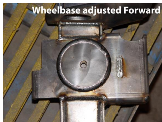
Wheelbase adjusted Forward