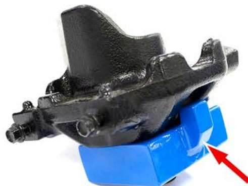
ANTI-ROTATE TAB (THIS SIDE IN)

19. Raise axle to hold springs in vehicle. BE SURE NOT TO OVER LIFT TRUCK FROM JACK STANDS.