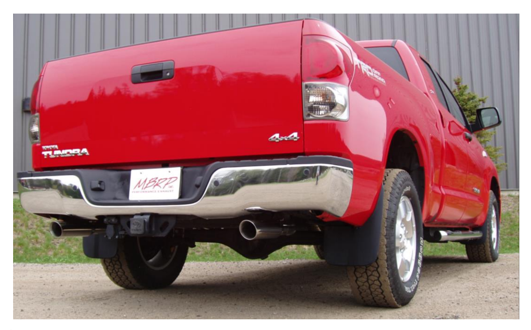
Congratulations! You are ready to begin enjoying the improved performance and driving experience of your MBRP Performance Exhaust system. We hope you enjoy your purchase!