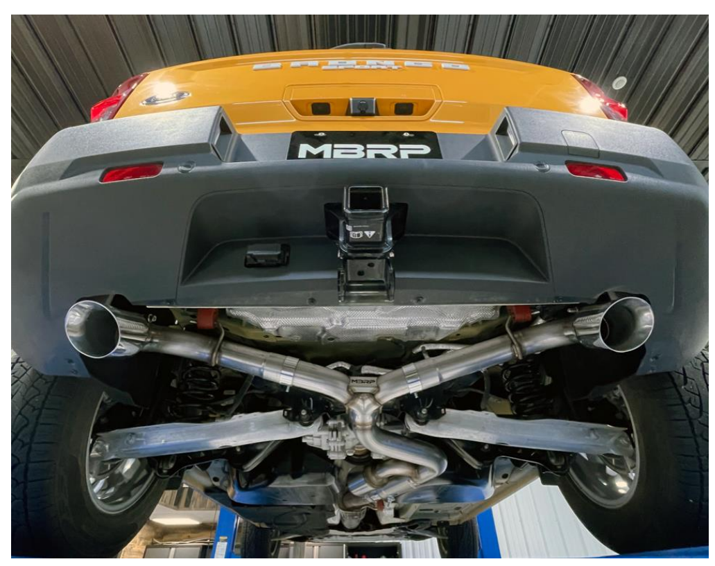
Congratulations! You are ready to begin experiencing the improved power, sound and driving experience of your MBRP performance exhaust system. We know you will enjoy your purchase.