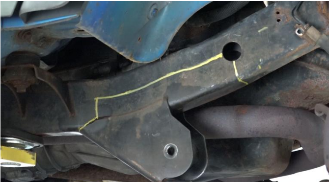
Repeat previous steps on inside of the frame rail once you cut away the upper control arm mount.

Using a tape measure, measure in from the front body mount bracket 1.5 inches and make a mark using a paint marker.