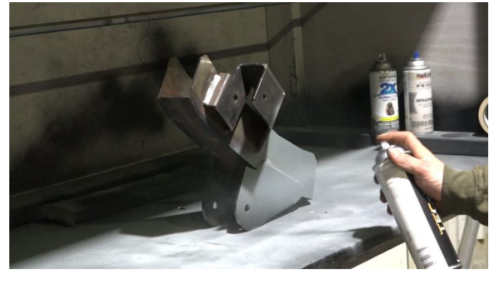
(OPTIONAL): Coat the part with a weld-able primer or other rust inhibitor to help prevent or reduce the risk of rust formation.

Once the part has been fitted, prepare your weld zones by clearing away any rust or debris, revealing bare metal.