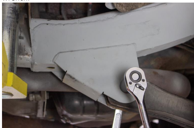
Reinstall upper control arm using 17mm socket.

Begin reassembling your vehicle by starting with the lower control arm using a 22mm socket and 22mm wrench.