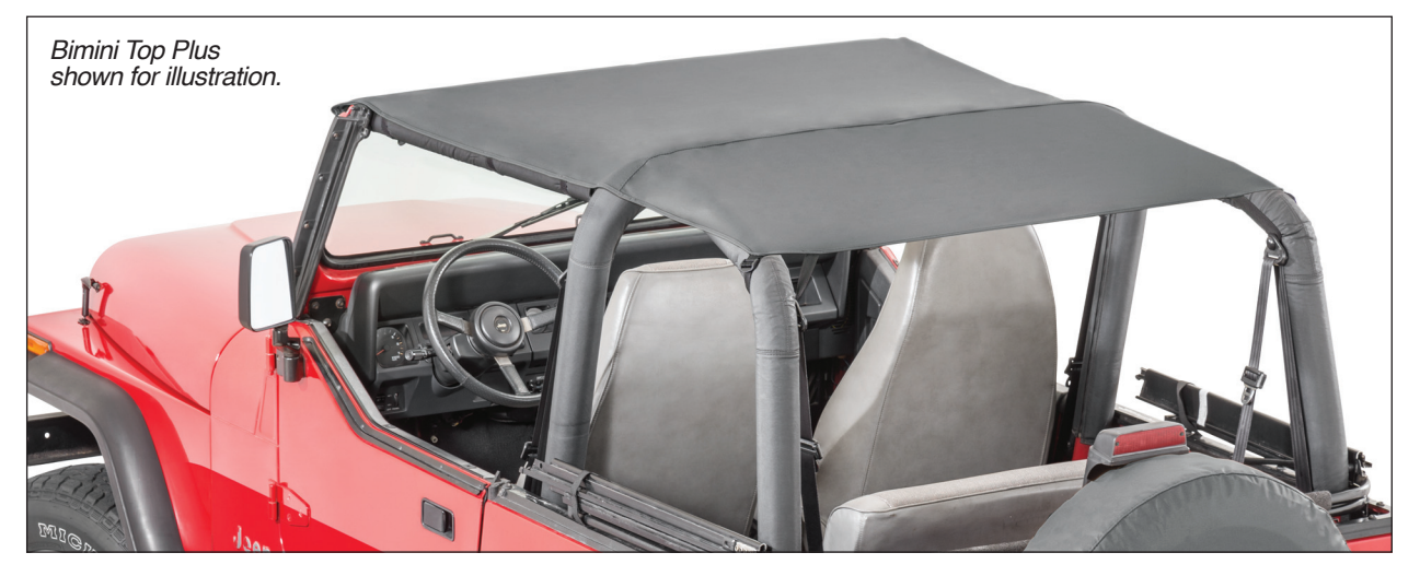
Parts List: Bimini Top or Bimini Top Plus - QTY 1

Bimini Top, Bimini Top Plus for 1987-1995 Jeep<sup>®</sup> Wrangler (YJ) Vehicles Items #141031XX and #143031XX