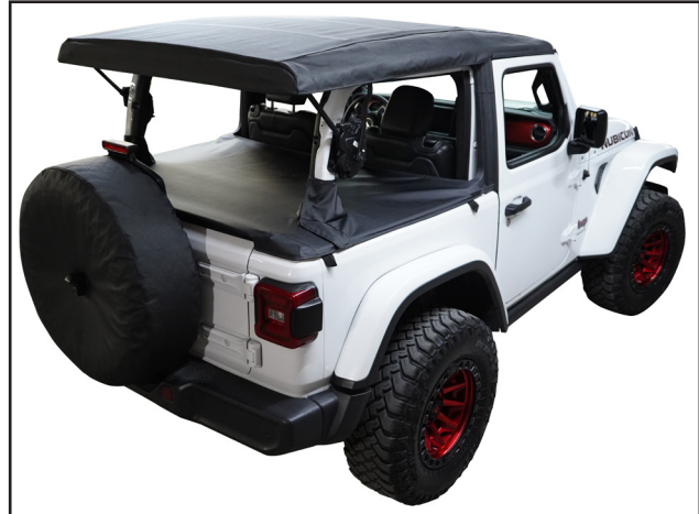
Soft Top Tonneau Cover only shown with the Factory Soft Top