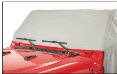
Keeps the heat out!