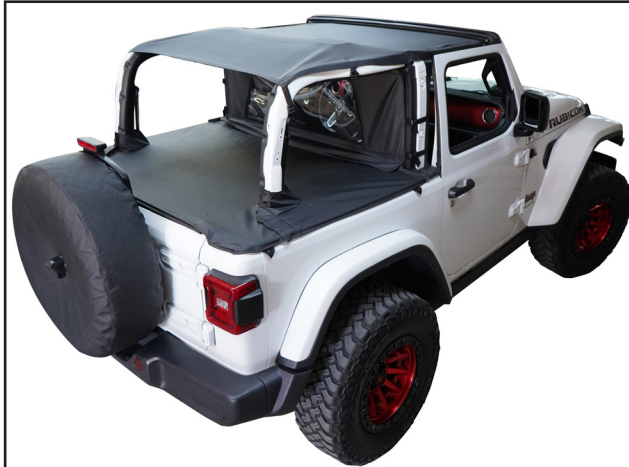
Wind Stopper/Tonneau Cover shown with an optional Bimini Top Plus

Items #144405XX, 144415XX, 145005XX, 145015XX