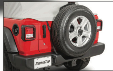
Easy on, Easy Off!