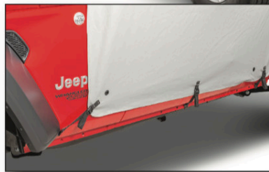
Protects Door Openings