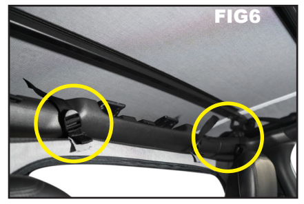
Step 1: Attach Center Straps to Center Roll bar

Locate the two center top straps of the Windstopper shown in FIG 4. Wrap the straps around the center roll bar and loosely connect the strap to the buckle (FIG5). Repeat on the other side so the Wind Stopper is hanging from the rear cross bar (Fig 6) NOTE: A regular Wind Stopper is shown in FIG 4. Installation on the Wind Stopper Plus is the same. Tighten these straps so the top of the Wind Stopper reaches the underside of the Roll bar/sound bar.