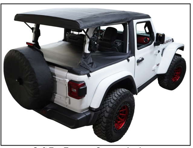
Soft Top Tonneau Cover only shown with the Factory Soft Top

Fabric Tonneau Cargo Cover QTY 1 Wind Stopper Plus QTY 1