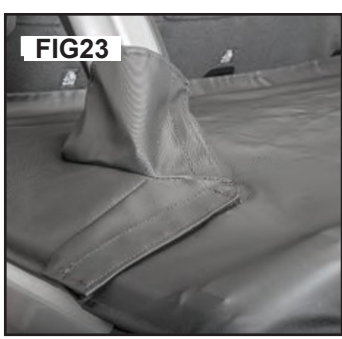
Step 7: Install the Tonneau Cover sleeves around the Roll Bar

Wrap the two collars around the sport bar and fasten the hook and loop strips to each other. See FIGs 22 & 23.