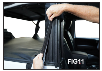
Step 3: Attach Side and bottom Straps to the Roll Bar/Seat Mount Bracket

Locate the two upper corner straps as shown in FIG 7. These straps go up inside the vehicle to the inside of the center roll bar, around and over the top of the roll bar and down to the buckle (Fig 8 & 9). Thread the buckle and tighten these straps securing the top of the Wind Stopper Plus to the Sound Bar (Fig 10). Repeat on the other side.