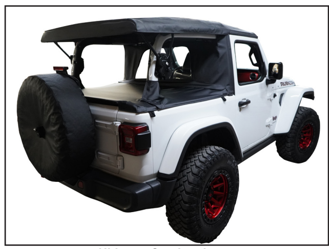
Ultimate Combo shown with the Factory Soft Top