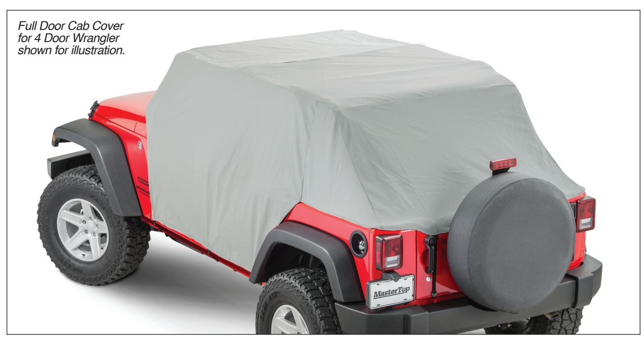
Parts List: Fabric Full Door Cab Cover, Qty 1

Items #11110009, #11110309 and #11110409