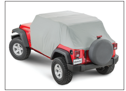
for 07-17 JK Wrangler 4-Door