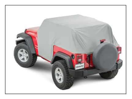
for 07-17 JK Wrangler 2-Door