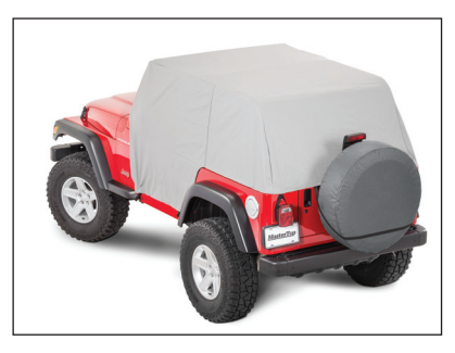
for 92-95 YJ & 97-06 TJ Wrangler