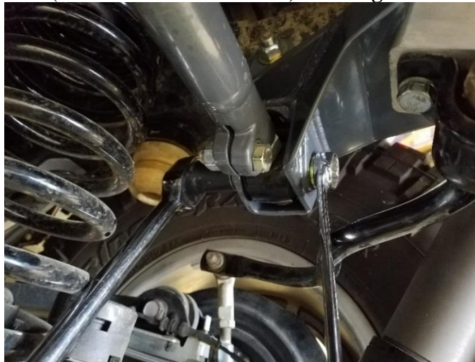
Figure 7. Torqueing the Rear Track Bar Bolt