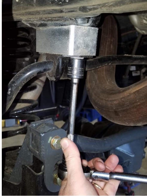
Figure 2. Removing Sway Bar Mounting Bolts