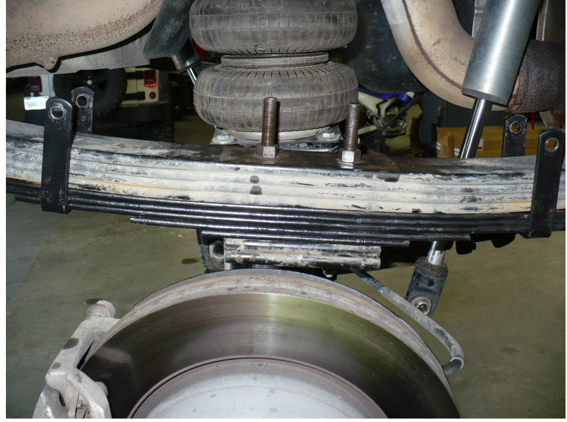
13) Align center pin(s) into axle perch and raise axle into place. Install U-bolts and spring plates at this time. Snug down U-bolt hardware evenly but do not fully tighten at this time.

12) Tighten center pin nut(s) to 80 ft-lbs and re-install spring clamp hardware.