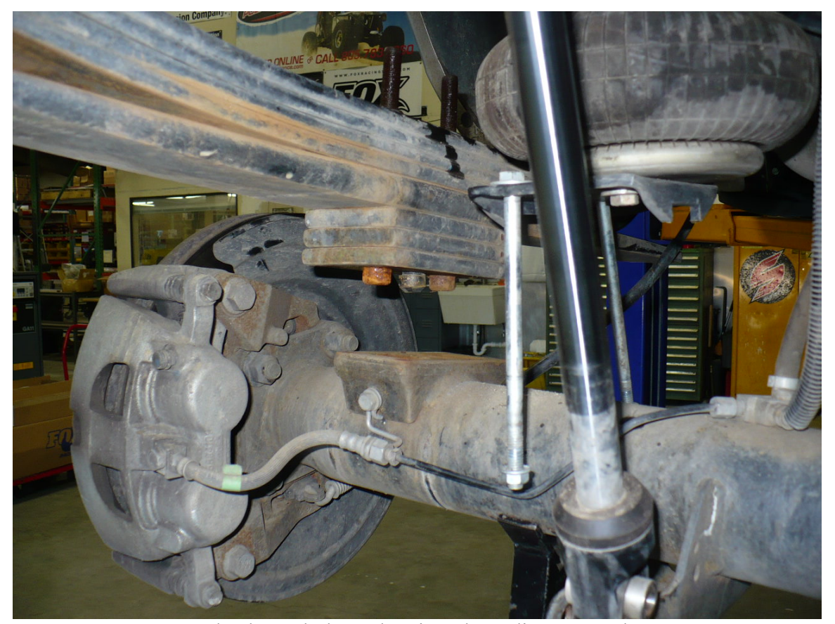
Shocks, U-bolts and spring plates disconnected.

4) At this time, it is a good idea to soak the center pin(s) with a quality lubricant or penetrating lube as they often rust and become difficult to remove.