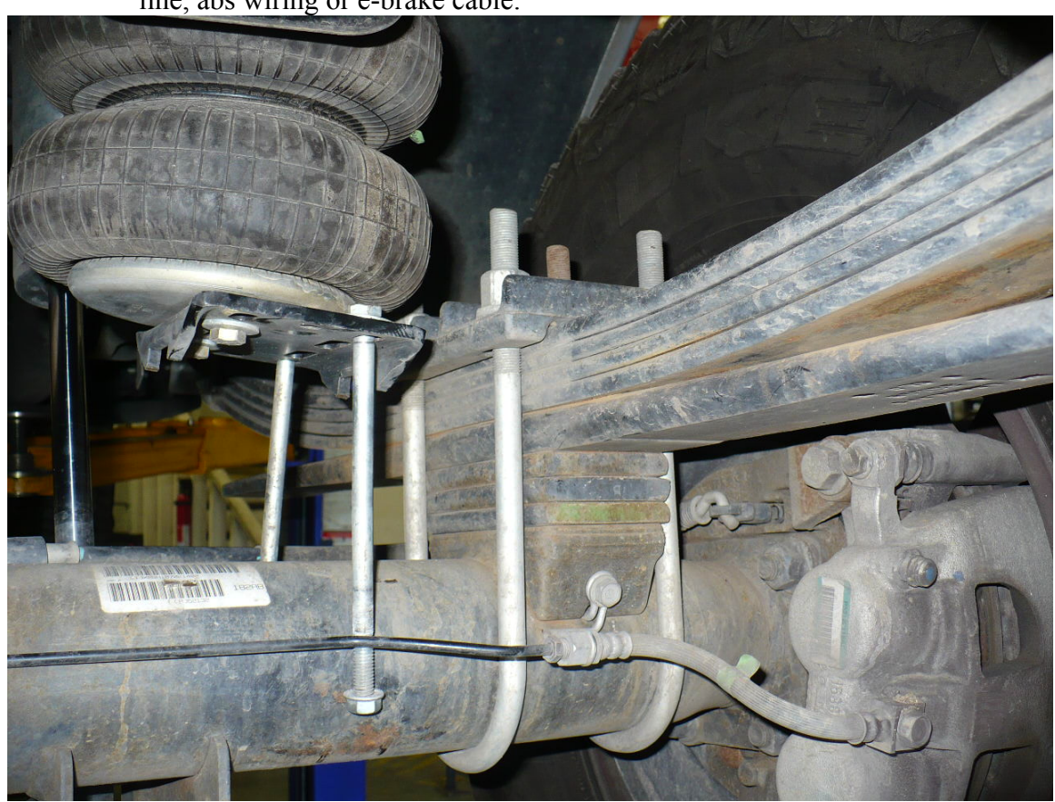
Stock rear suspension prior to tear down.

**CAUTION** Be sure to safely support the rear axle and not let it hang by the brake line, abs wiring or e-brake cable.