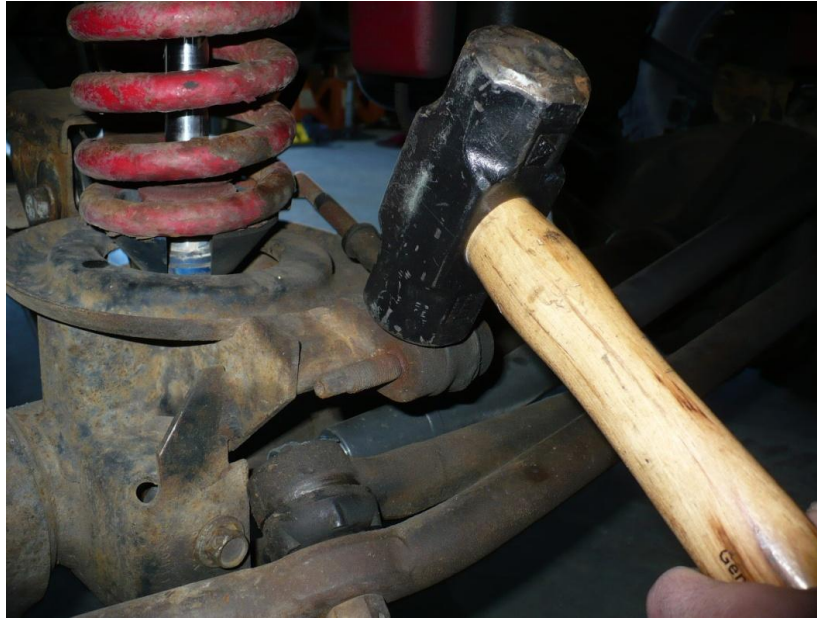
Figure 1. Using Hammer to Release Taper Fit