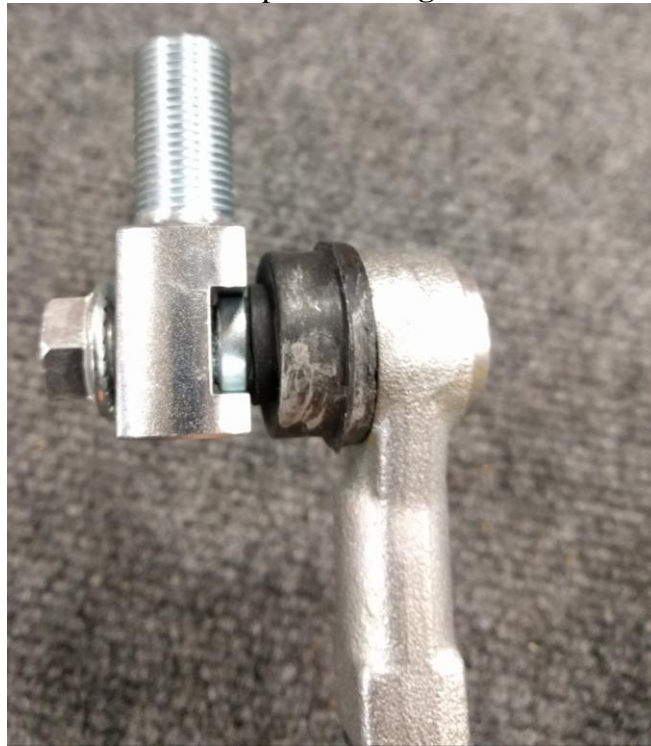
Figure 3. Properly Assembled Sway Bar End Link