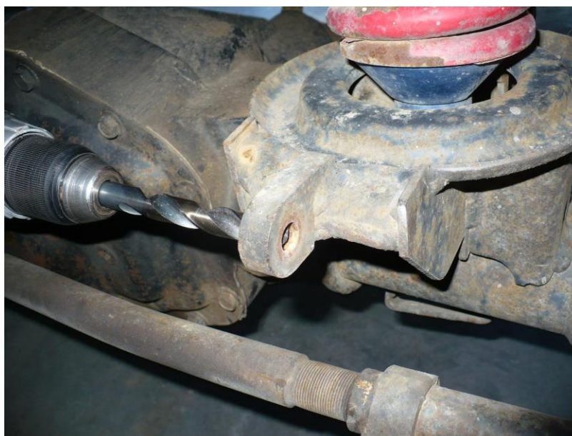
Figure 2. Drilling Out Lower Mount to 1/2"